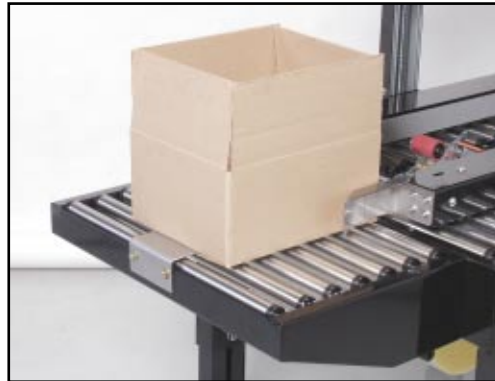
Box Shoe Shown Holding Carton in Place