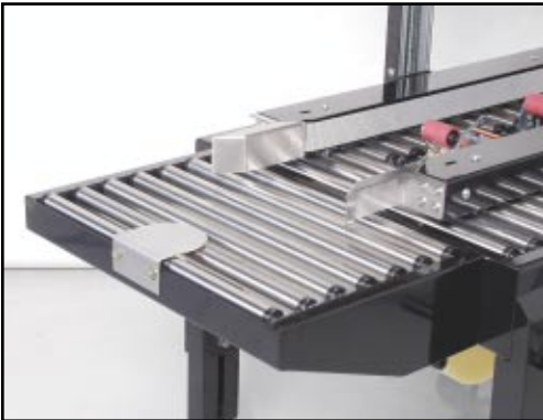
Box Shoe Holds Carton in Place for Packing