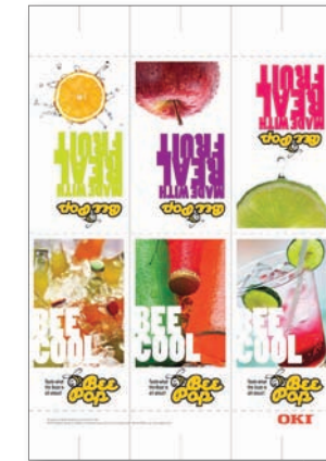
Table Tents – Spot Clear toner makes color even more vibrant on industry-standard substrates

Pocket Folders – Spot White and Clear toner give powerful emphasis to text and graphics; handles heavy stock (up to 360gsm)