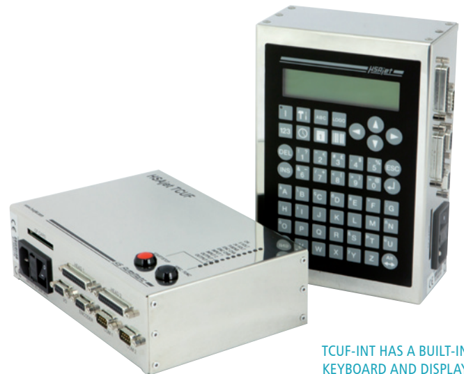
TCUF-INT HAS A BUILT-IN KEYBOARD AND DISPLAY

The TCUF controllers are designed for limited printing jobs still requiring a high-resolution and high quality print