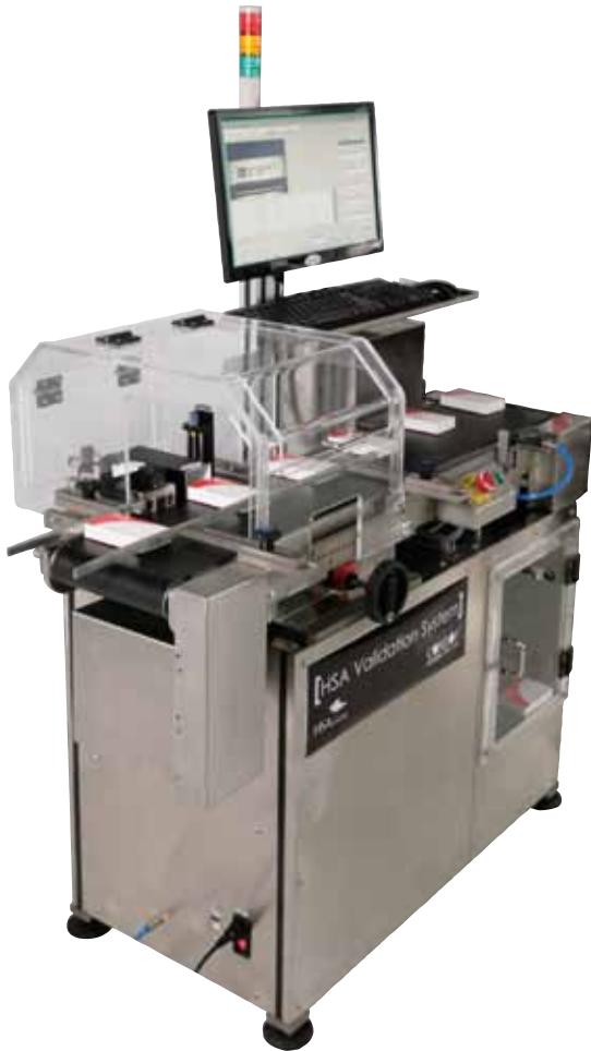
HSAJET Print & Verify System through Condot, India

The following pictures show the Print & Verify system being used for box printing. The system below have been built into hardware integrated by HSA OEM partners, the system pictured over page is built by HSA to a customer specified end to end process.