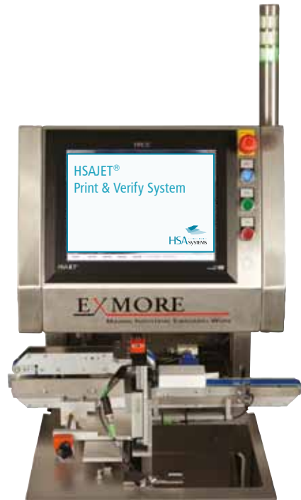
System integration with MV100 from Exmore, Belgium