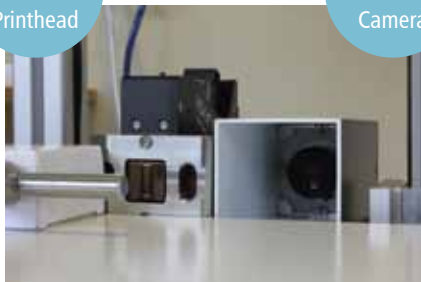
HSAJET Vision Camera