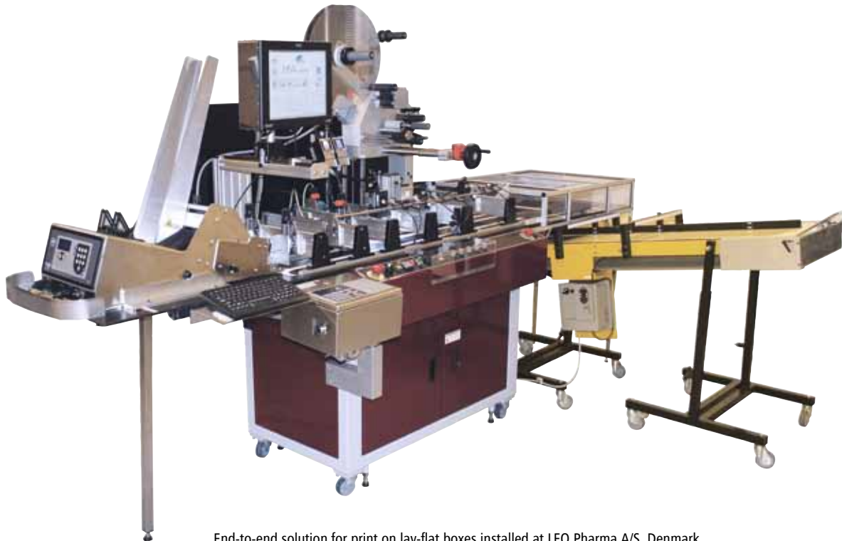
End-to-end solution for print on lay-flat boxes installed at LEO Pharma A/S, Denmark. Feeding of lay-flat boxes > Print of 2D Datamatrix - Logo - Product type > Vision control > Label > Label position check > Accept or Reject