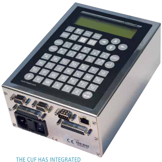
THE CUF HAS INTEGRATED KEYBOARD & DISPLAY

The Controller Unit is equipped with ethernet and serial communication allowing full remote controlled variable printing. In combination with HSAJET® printheads it has the function of a stand-alone system.